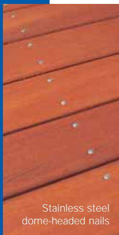
Stainless steel dome-headed nails

When you use Boral Timber hardwood decking you have the quality assurance that only Boral Timber's native hardwood - sourced from sustainably managed forests - can provide. It's a guarantee that the protection of our forests for generations to come is implemented by Boral's commitment to the principles of Ecologically Sustainable Development.