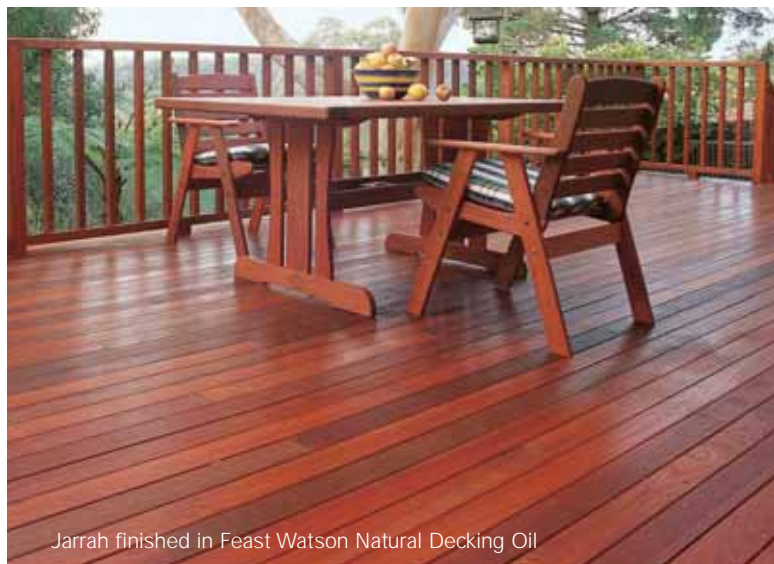
Jarrah finished in Feast Watson Natural Decking Oil